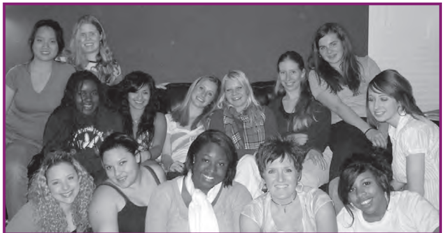
Unidas Participants 2008-09

The Women's Foundation of Southern Arizona would like to thank the Lovell Foundation and Every Voice in Action Foundation™ for their ongoing support of Unidas. ✨